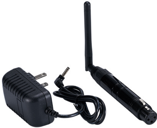
DM-WR DMX512 wireless receiver

RF 2.4GHz/Automatic jumping frequency/7 groups ID code/Max. 400 meters