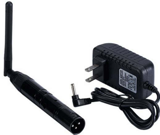
DM-WT DMX512 wireless transmitter

DMX512 wireless receiver/transmitter transmits standard DMX512 protocol data(generated by console) by wireless way. No time delay when signal data is transmitting, signal data is real time and reliably. This product adopts a 2.4G ISM frequency section. High effect GFSK modulate communication design, jumping frequency automatically, high anti-jamming ability.